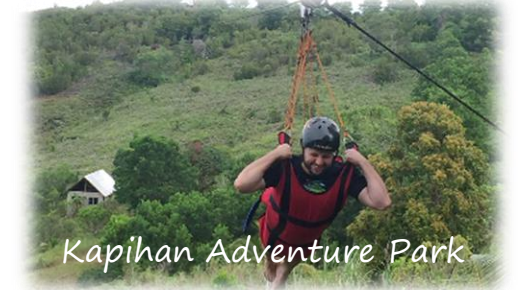
Kapihan Adventure Park